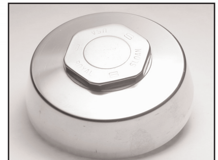
Permanently mark identification numbers and logos on your parts.

Specifications and dimensions are shown on back.