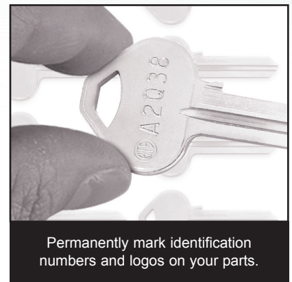
Permanently mark identification numbers and logos on your parts.

The Air-Over-Oil presses from Schmidt bring a new and improved concept in marking technology to the marketplace. These presses offer a smooth and quiet operation and at the same time help to eliminate the bounce effect on your parts. Air pressure is used to rapidly move the ram, where hydraulic pressure slowly squeezes the impression into your part. Available in two capacities with 2.5 inches of adjustment, these presses can help satisfy your low volume marking requirements.