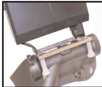
Custom Stand Off