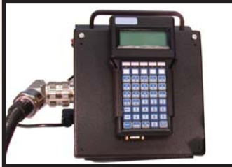
Portable Controls w/ LCD