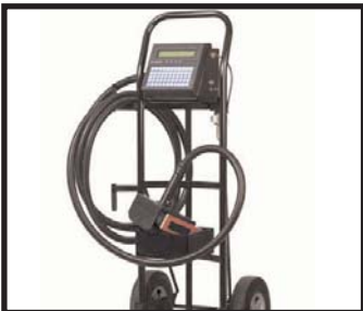
Cart w/ LCD Controls