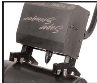
Magnetic Stand Off