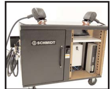
Dual Stinger Mobile Cart