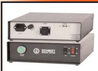
Mini Controls - PC Required

Communications for the Stinger series are interfaced with a stable and flexible software package. The software is available in two configurations; StyleWrite for Windows operating environments and our original Style40 software platform.