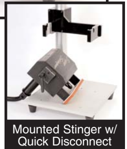
Mounted Stinger w/ Quick Disconnect